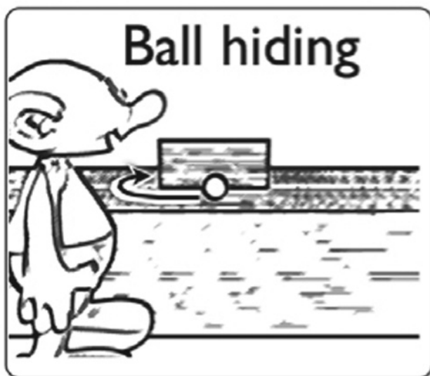
Fig. 3. An example of the stimuli used in the Smurf test of false belief attribution. Reprinted with permission from Kovács, Téglás, and Endress (2010).

The results of the other experiments in the series by Kovács et al. (2010) are also consistent with the submentalizing interpretation. In Experiment 2, the critical result was replicated when in all conditions a pile of boxes took the place of the Smurf in Phase 3. Thus, in this experiment, as in Experiment 1, an abrupt visual onset—appearance of the boxes—of the kind that is known to be especially effective in grabbing attention and thereby causing retroactive interference (Egeth & Yantis, 1997) occurred immediately after the last ball movement in the P-A+ condition but not in the P-A- condition. In Experiment 3, the critical result was not observed. A pile of boxes replaced the Smurf in all phases of this experiment, and it was continuously present; it did not disappear in Phase 2 and reappear in Phase 3. Consequently, there was no event in any condition likely to cause