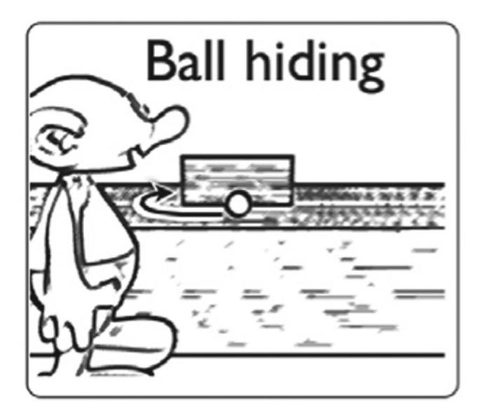
Fig. 3. An example of the stimuli used in the Smurf test of false belief attribution. Reprinted with permission from Kovács, Téglás, and Endress (2010).

the ball was behind the occluder. Finally, in the P+A-condition, the ball made the same two moves it made in the P+A+ condition, but the Smurf was present when the ball left the screen and was absent when it returned to its position behind the occluder. Therefore, the participant (P+) believed (truly) that the ball was behind the occluder, whereas the agent believed (falsely) that the ball was not behind the occluder (A-).