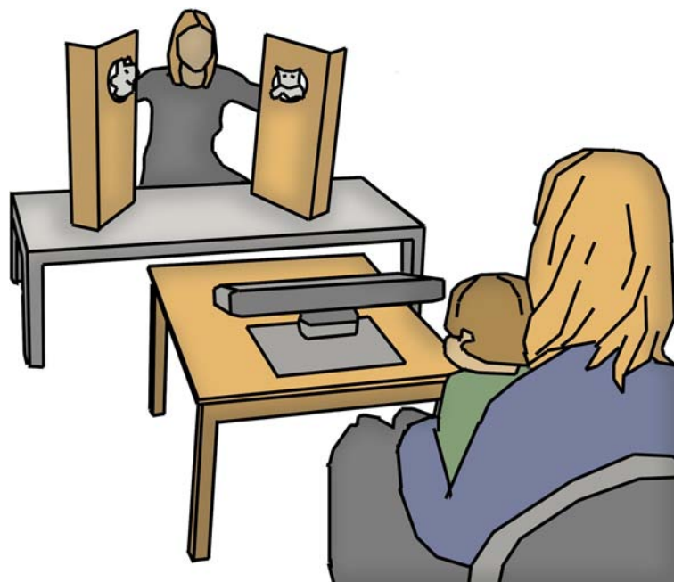
Fig. 1 Sketch of the experimental setting. The infant and parent were seated at a distance of 200 cm from the experimenter. The visual angle of the experimenter's face subtended 4.5° by 7°, and the holes where the puppets appeared each had a visual angle subtending 3.5° by 3.5°. A Tobii TX300 eye tracker (placed on a table in front of the infant) recorded the gaze of the infant. Two video cameras (not visible in the sketch) recorded the behavior of the infant as well as the stimulus area

Each trial started with the experimenter calling the infant's name in order to elicit a gaze shift back to the experimenter's face. If necessary, the name was called a second time, and if the infant still did not respond, the experimenter made a third attempt by making a funny face and a sound. Once the infant made eye contact, or after three unsuccessful attention bids had been administered, the experimenter shifted gaze toward one of the two puppets while making an excited vocalization ("O")—a Swedish interjection expressing surprise or excitement). The experimenter